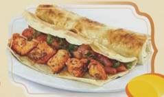
Shish Tawook meal