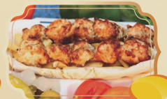
Shish tawook sandwich