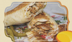
Chicken shawarma sandwich