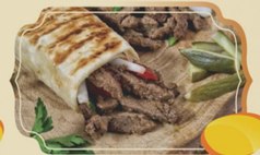
Meat shawarma sandwich